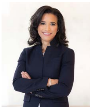
Great Lakes Room - 4:00-4:10 p.m.