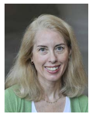
Professor of Public Policy and Economics, University of Michigan Ford School of Public Policy

empirical investigation into corporations' waivers of the duty of loyalty; and a series of related projects studying the intersection of market microstructure and regulation.