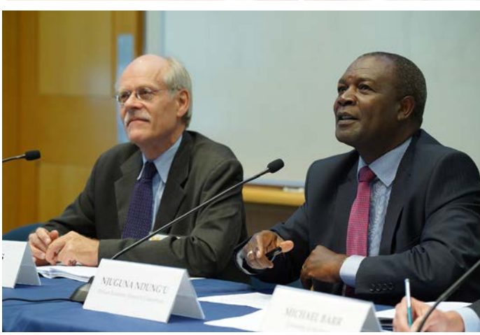
Additional CFLP Conferences & Speakers